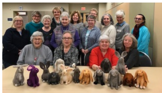
Above: felted rabbits made by the participants at the February 23 workshop