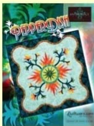
Pepperdish Level: Confident beginner and above