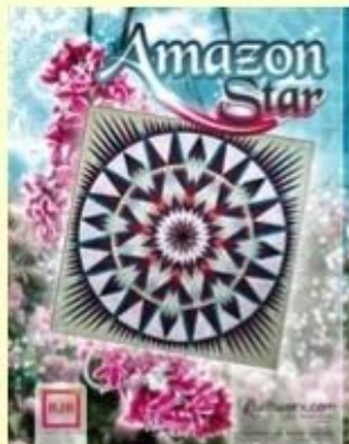
Amazon Star Level: Intermediate and above