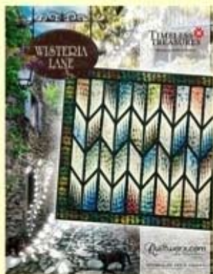
Wisteria Lane Level: Beginner and above