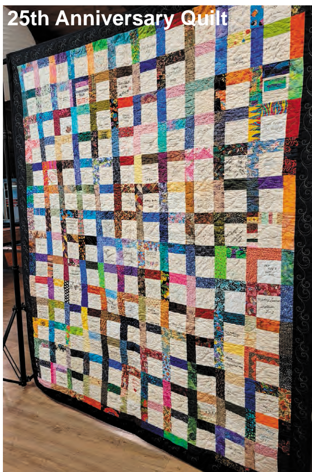
25th Anniversary Quilt