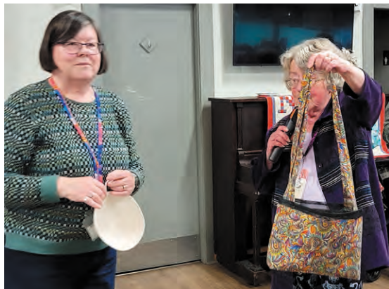
Left: an example of the clothesline / rope bowl workshop and the mesh bag workshop