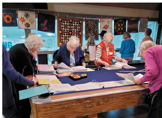
Right: members peruse the many history photo binders provided by the Guild History Committee at the 40th Anniversary Tea