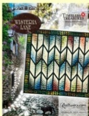
Wisteria Lane Level: Beginner and above