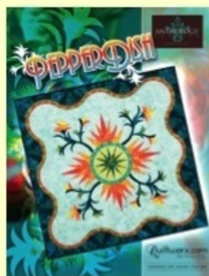
Pepperdish Level: Confident beginner and above