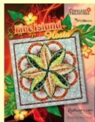
Fire Island Hosta Intermediate and above

For more information, and to see what else is on offer, visit www.sewpeaceful.com