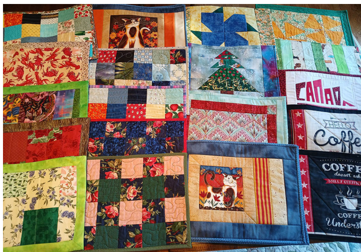
More of the 87 placemats handed in on September 17!