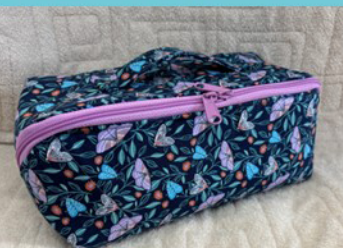
Spring Roll Pouch Pattern