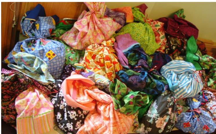
Bags from previous years

The dollar stores have most of these items at affordable prices, and we welcome sample sizes of items from hotels and cosmetic counters. Any questions? Contact Sue Creba at 250-753-3371 or suecreba@aquariusd.com